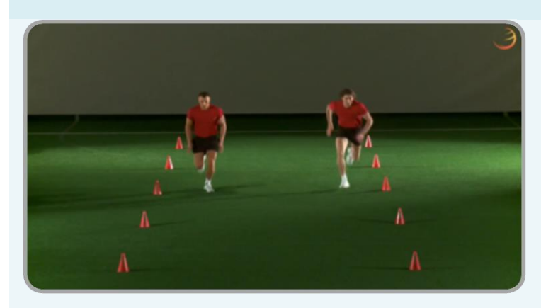
80% forward, slow back x 2

Run at 80% your max pace. Upper body lean as work up pace, body upright when get to line. Hips, knees and ankles aligned. Complete twice.