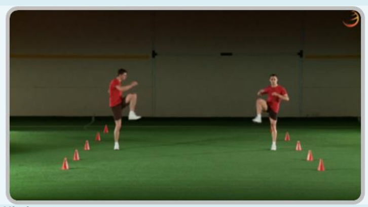
Hip out x 2

Jog five steps, stop and lift your knee forwards. Rotate your knee to the side and put your foot down. Leg you are standing on stays straight, heel on the ground. Do not allow knee of stance leg buckle inwards. After five more steps, repeat exercise on the other leg. Repeat until you reach the 20 m line. Jog back.