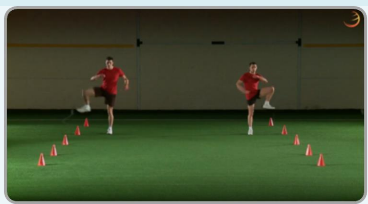
Hip in x 2

Jog five steps, stop and lift your knee to the side. Rotate your knee forwards and put your foot down. Make sure that the leg you are standing on stays straight. After five more steps, repeat exercise on the other leg. Repeat until you reach the 20m line. Jog back.