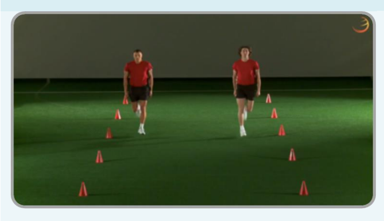
Heel Flicks x 2

Jog towards the 20m line. Taking short strides flick your heels towards your glutes. Your upper thigh should remain perpendicular to the ground. Jog back to the end line. Complete twice.