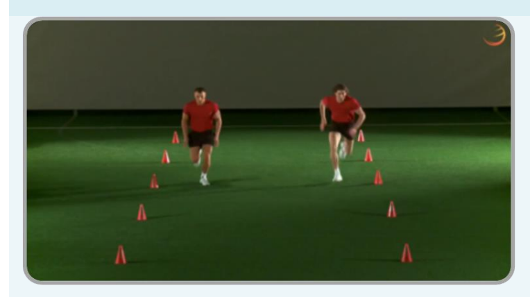
50% forward, slow back x 2

Run quickly (50%) to the 20m line then jog back. Keep your upper body straight. Hips, knees and ankles should be aligned. Complete twice.