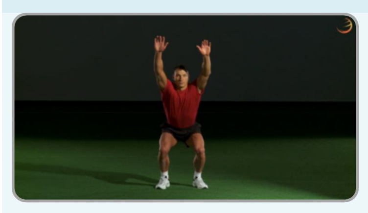
Squats (pelvic mobility)

LEVEL ONE: Double leg Squat x 8 reps, 2 sets.